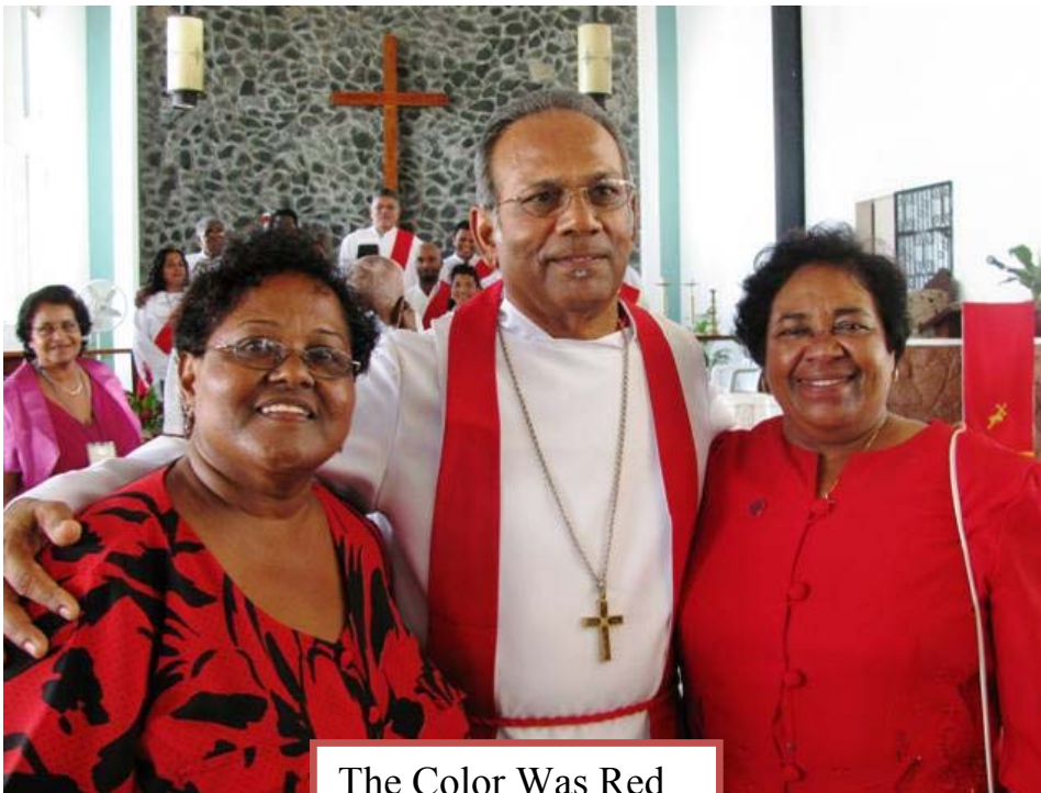
The Color Was Red